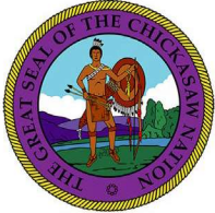
Bill Anoatubby Governor

WHEREAS, the Inter-Tribal Council of the Five Civilized Tribes (ITC) is an organization that unites the tribal governments of the Cherokee, Chickasaw, Choctaw, Muscogee (Creek) and Seminole Nation, representing approximately 815,000 Indian people throughout the United States; and