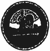
Bill Anoatubby Governor