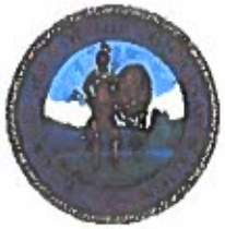
Bill Anoatubby Governor

WHEREAS , the Inter-Tribal Council of the Five Civilized Tribes (ITC) is an organization that unites the tribal governments of the Cherokee, Chickasaw, Choctaw, Muscogee (Creek), and Seminole Nations, representing approximately 750,000 Indian people throughout the United States; and