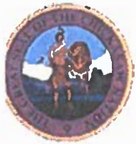
Bill Anoatubby Governor

WHEREAS, the Inter-Tribal Council of the Five Civilized Tribes (ITC) is an organization that unites the tribal governments of the Cherokee, Chickasaw, Choctaw, Muscogee (Creek), and Seminole Nations, representing approximately 750,000 Indian people throughout the United States; and